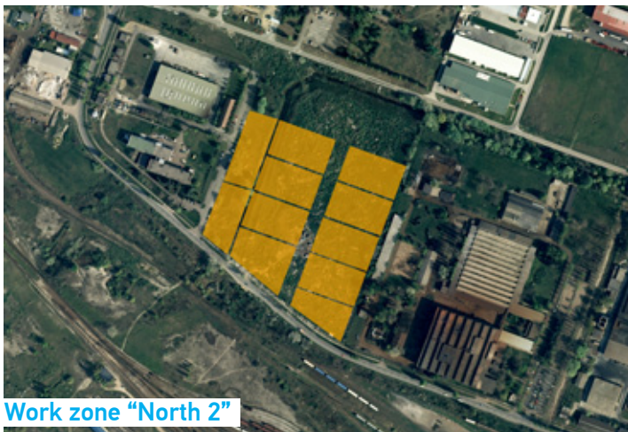
Work zone "North 2"

Greenfield: aprox. 6ha, aprox. 70 lots, 50€/m 2 starting price at public auction